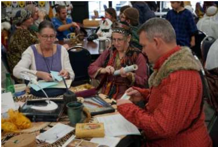
Bobbin Lace and much fun with the Calafian Orb at Calafia Winter Arts

http://caidwiki.org/index.php?title=Arachne%27s_Web_Lace_Guild